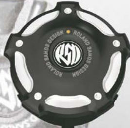
GEAR DRIVE 0210-2014